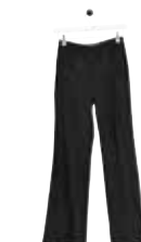
Lindbergh trousers w