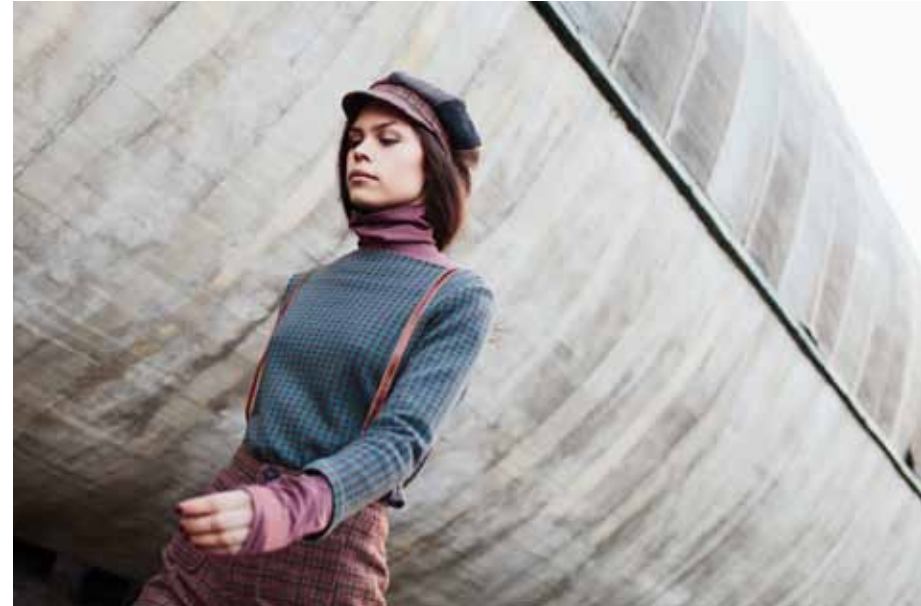
Scarf and sweater Sikorsky jacket Lindbergh