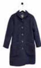
Wright coat w