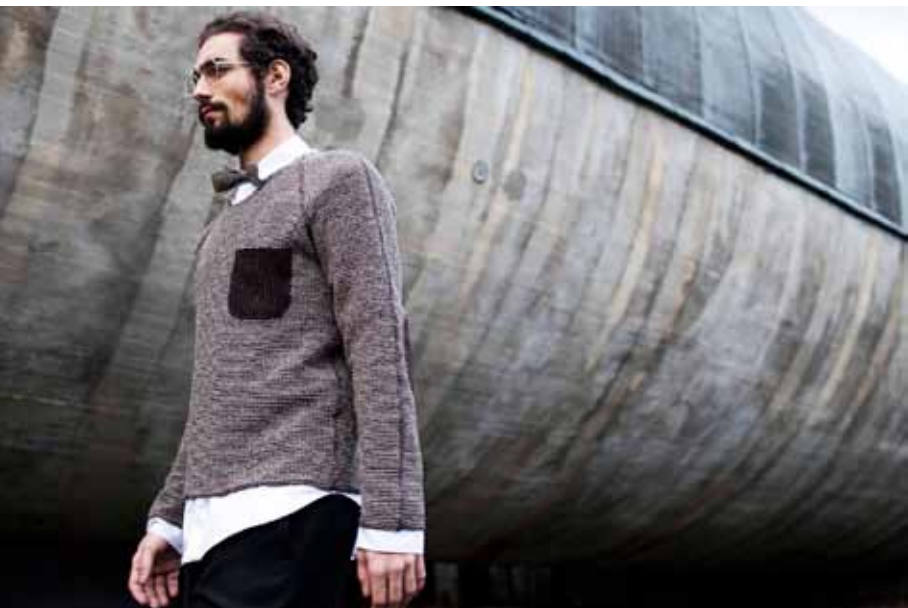
Shirt Basic sweater and slipover Sikorsky trousers Lindbergh