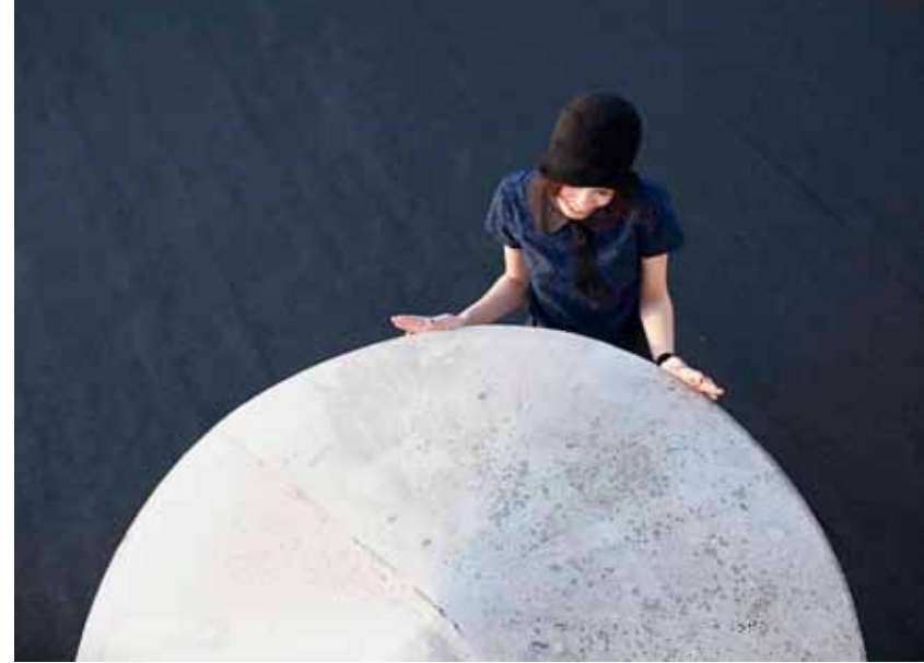
Blouse Auriol trousers Lindbergh